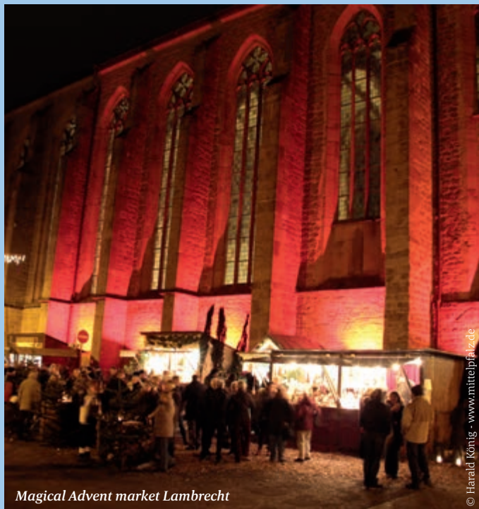
Magical Advent market Lambrecht

www.bad-bergzaberner-land.de · info@bad-bergzaberner-land.de